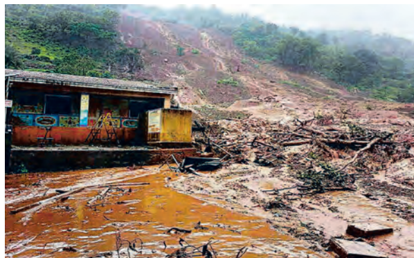
4.4 : The disaster at Malin village