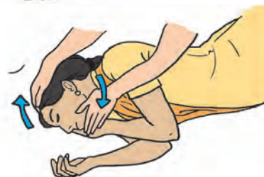
4.10 : First aid for sunstroke