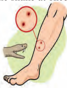
4.11 : First aid for snakebite