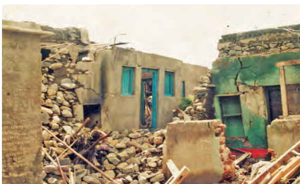
4.2 : Effects of the earthquake at Killari