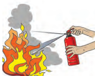
4.7 : Remedial and preventive measures