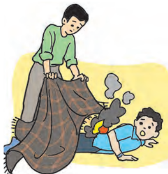
4.9 : Immediate steps for burns