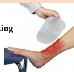
4.8 : Bleeding

If a person is bleeding, first make him sit or lie down comfortably. Keep the bleeding part of the body above the level of the heart and clean it with water.