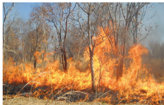
4.6 : A forest fire