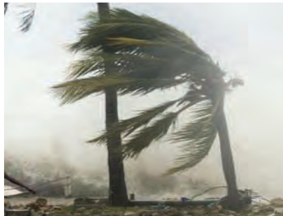
4.5 : A storm